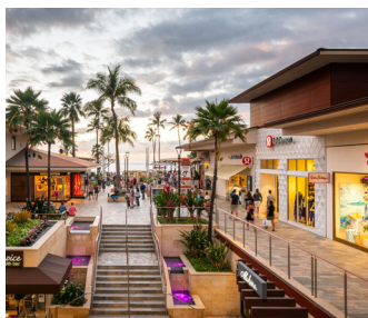
MIXED USE, RETAIL AND ENTERTAINMENT 42 mixed-use properties 127M sf retail properties 600K sf entertainment