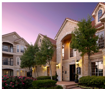
HOUSING ~63,000 apartment units ~58,000 student housing properties ~44,000 manufactured housing pads ~14,000 senior living units ~10,000 single-family rental homes