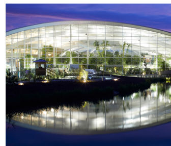
HOSPITALITY 41K keys