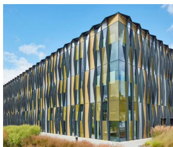
SCIENCE & INNOVATION 2M sf