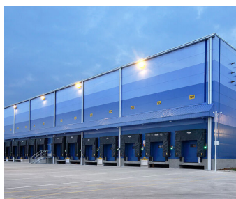
LOGISTICS 73M sf